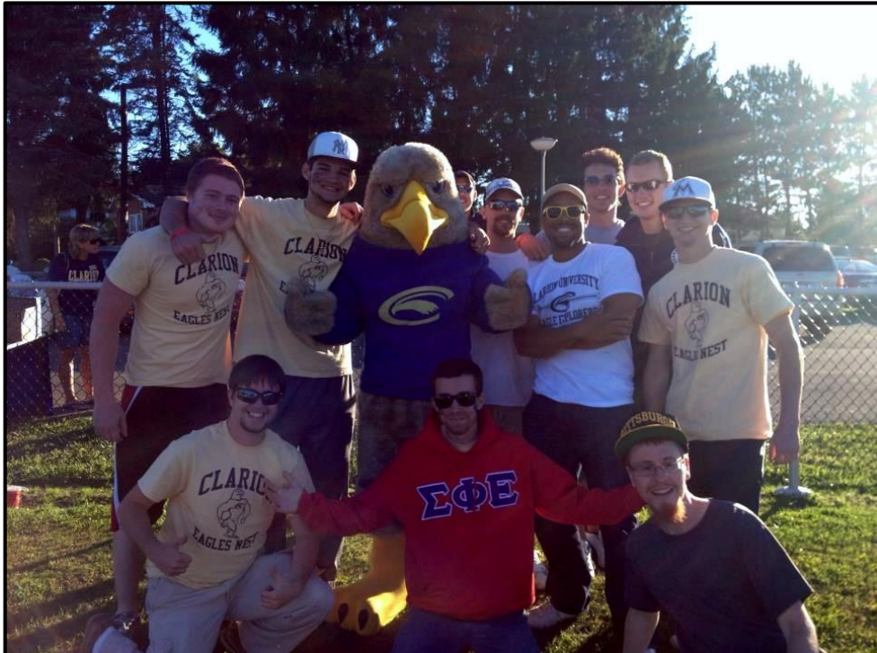
BROTHERS POSE WITH ERNIE THE EAGLE AT A GOLDEN EAGLE FOOTBALL GAME