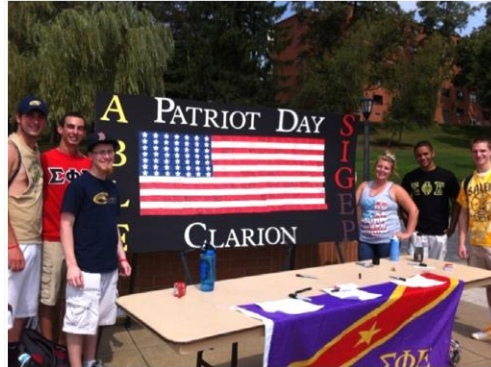
The SigEp Patriot Day Service Project (above) and the new Free Speech Apple, decorated by Brothers for September 11 below.